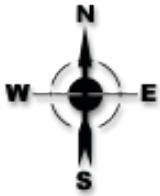
Sketch Floor Plan